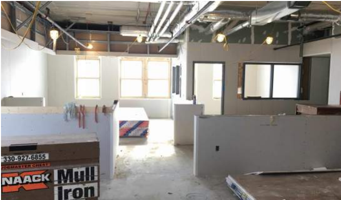
Drywall Installation in Area F Cedar Level