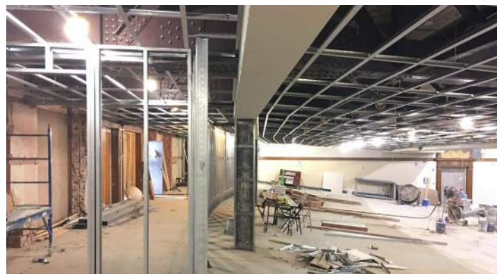
Metal Stud Framing in Area G Auditorium Cedar Level