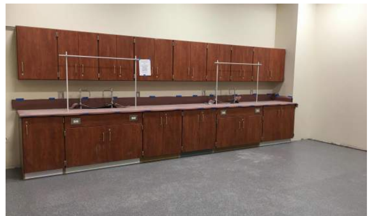
Rubber Flooring Installation in Area A 3rd Floor