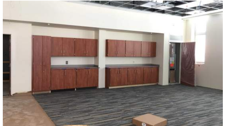
Carpet Tile Installation in Area A 3rd Floor